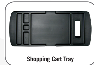
Shopping Cart Tray