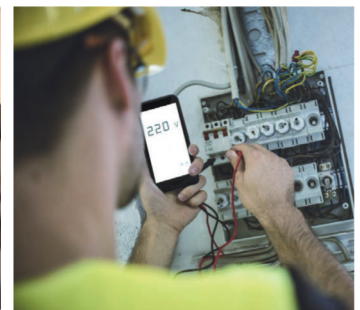
Electric Power Inspection